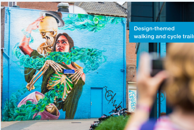
Design-themed walking and cycle trails