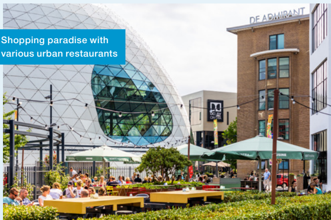
Shopping paradise with various urban restaurants