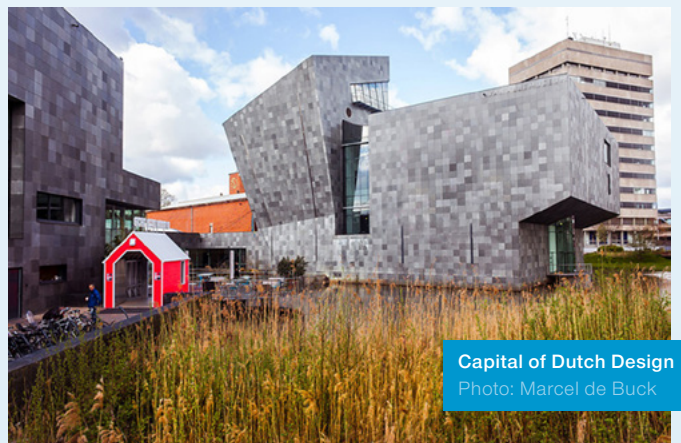
Capital of Dutch Design